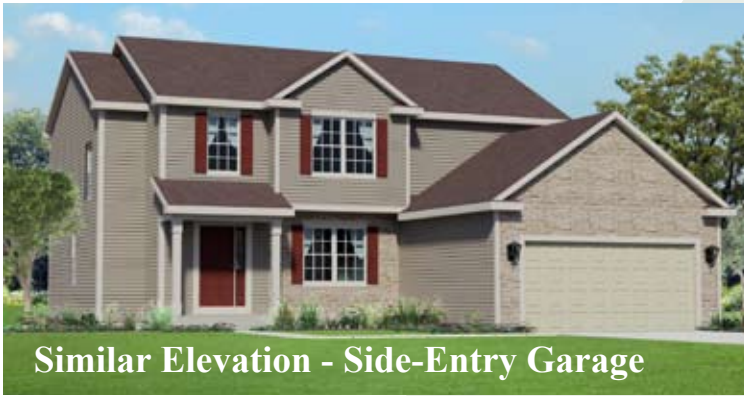
Similar Elevation - Side-Entry Garage

2,352 sq. ft. 2826 16t Place (lot 26) Hunter Ridge | Kenosha Move In March